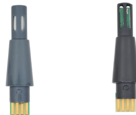
Hygrostick part number POL4750, for high moisture applications.