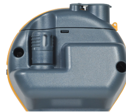
Quikstick ST POL8751, standard with all MMS2 kits and with the same performance as the standard Quikstick. A Quikstick ST can remain connected to the MMS 2 while using the pins.

Readings from multiple Hygrosticks can be taken and recorded with ease. Humidity readings can be taken with the use of humidity sleeves or humidity box. Hygrosticks, not Humisticks, should be used for this test.